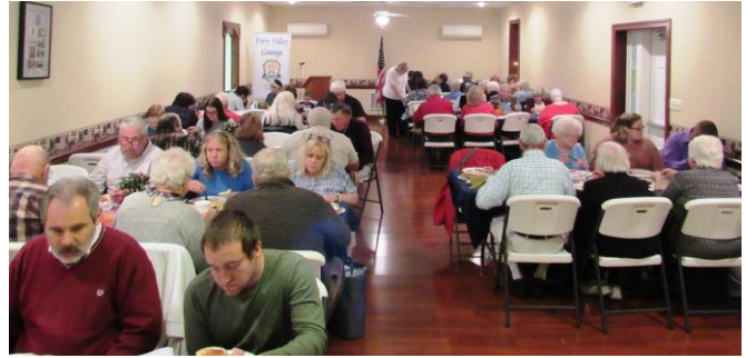
About 70 persons enjoyed the dinner and program