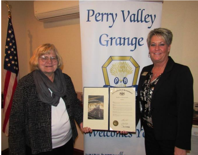
Citations received from the State Senate & House